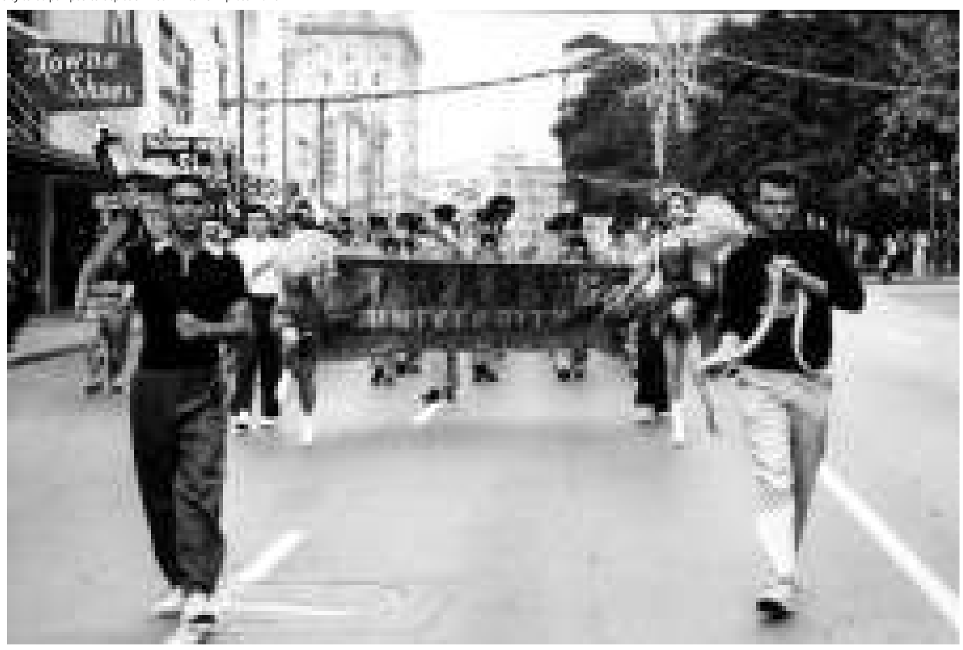
What S.A. looked like the decade you were born