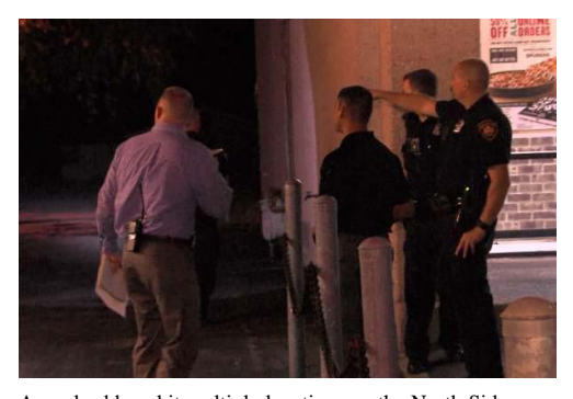
Armed robbers hit multiple locations on the North Side...