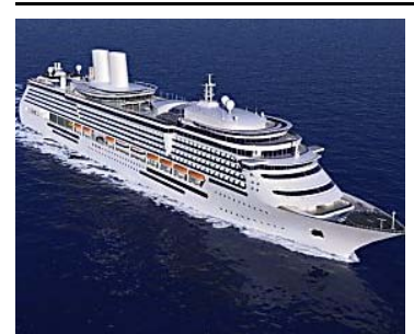
Plan a Last-Minute Getaway: The Most Amazing Cruise Deals Yahoo Search