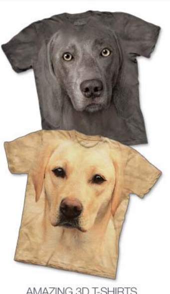
AMAZING 3D T-SHIRTS