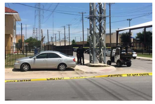
SAPD: Bystander shot when ex-boyfriend fires on group