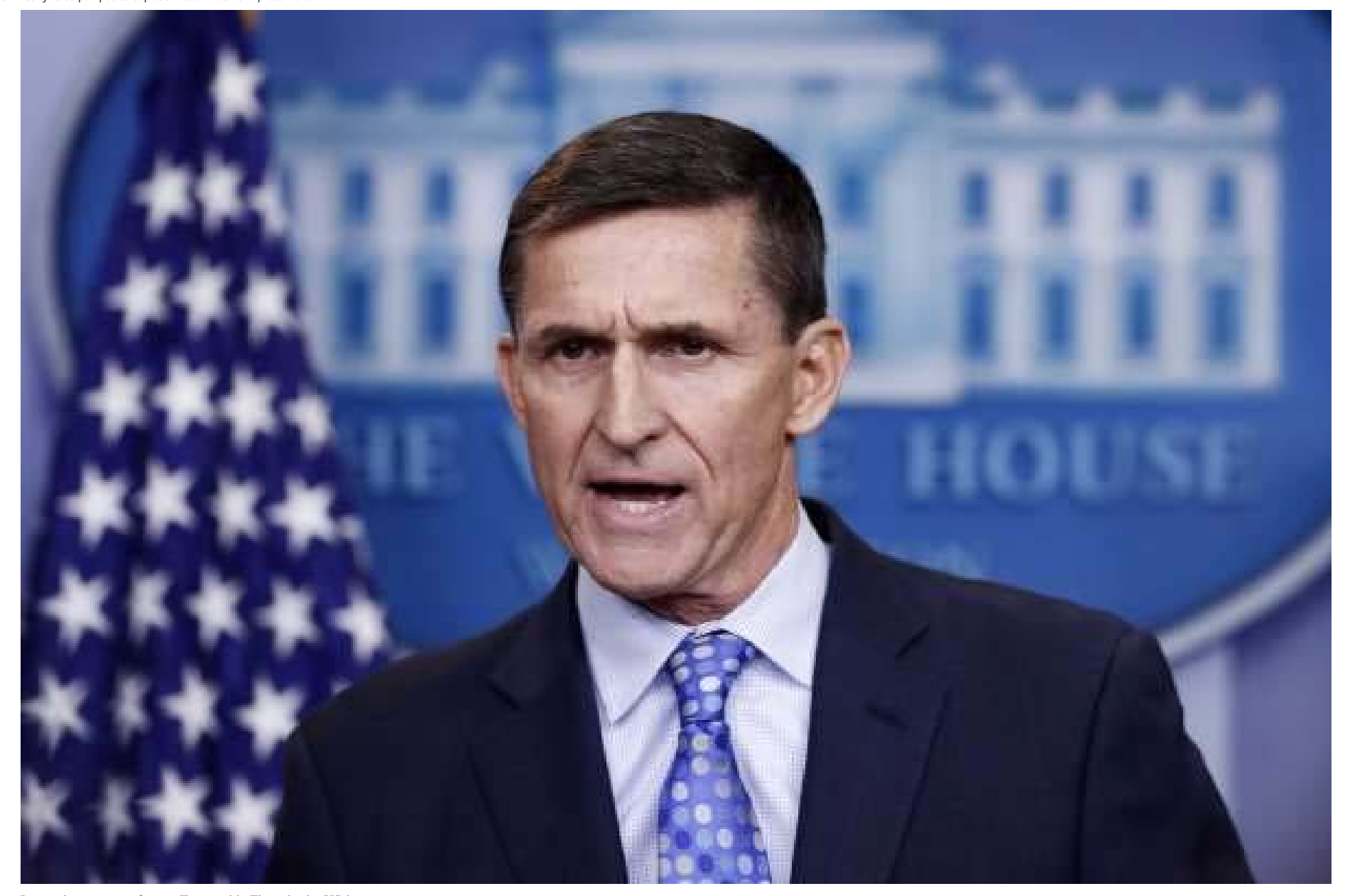
Lawmakers suggest former Trump aide Flynn broke US law