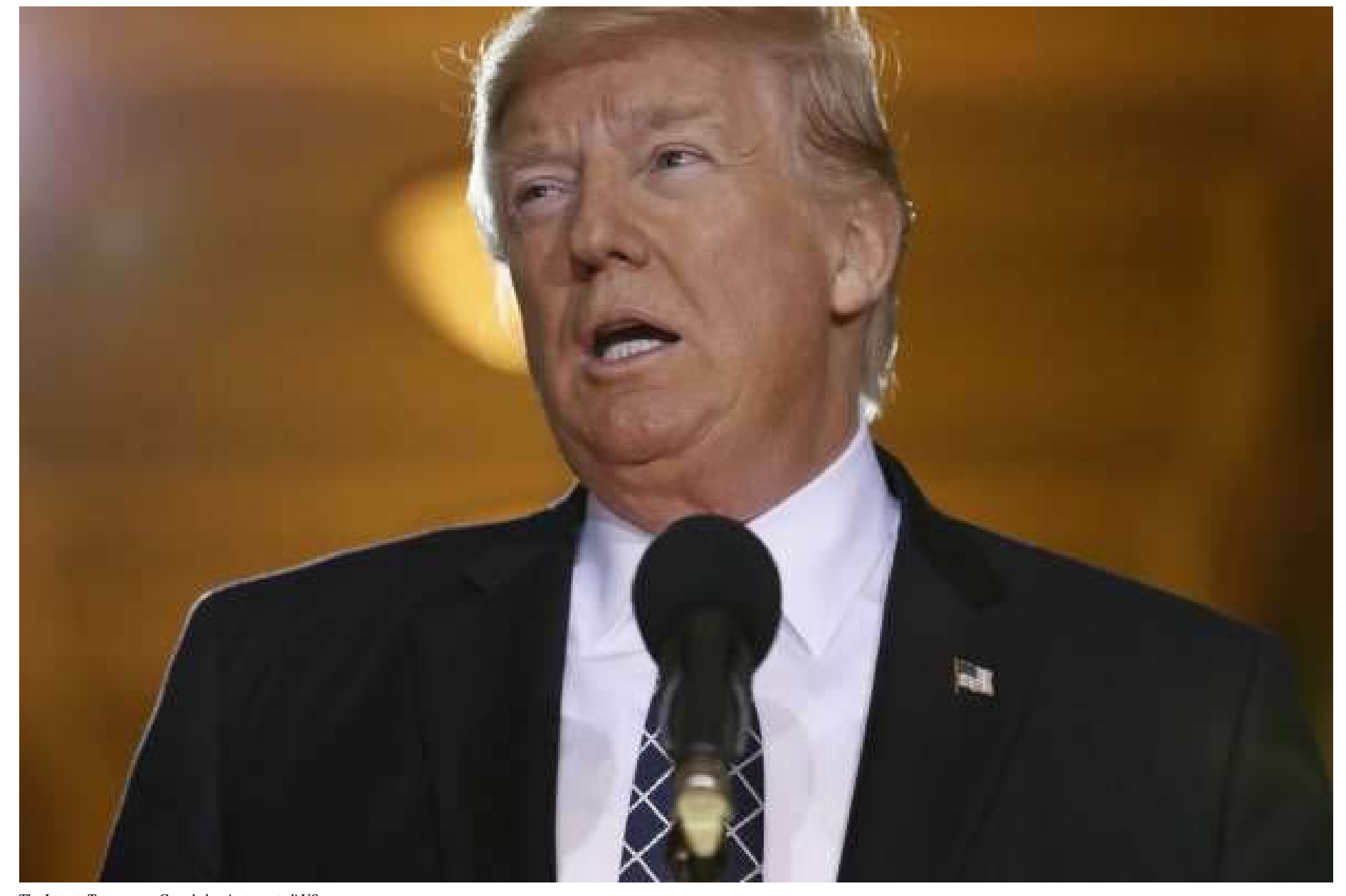
The Latest: Trump says Canada has 'outsmarted' US