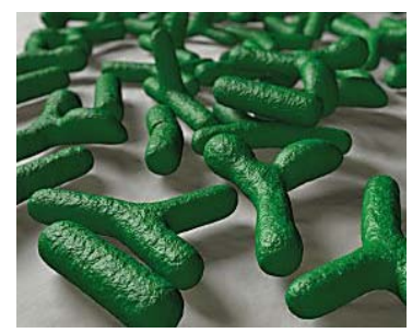
Intestinal problems - what you should know Health-daily