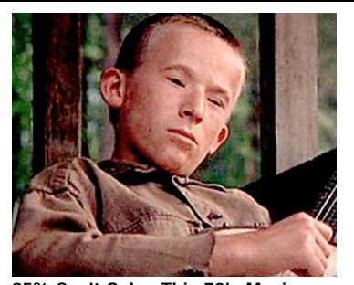
85% Can't Solve This 70's Movies Quiz. Can You? Direct Expose