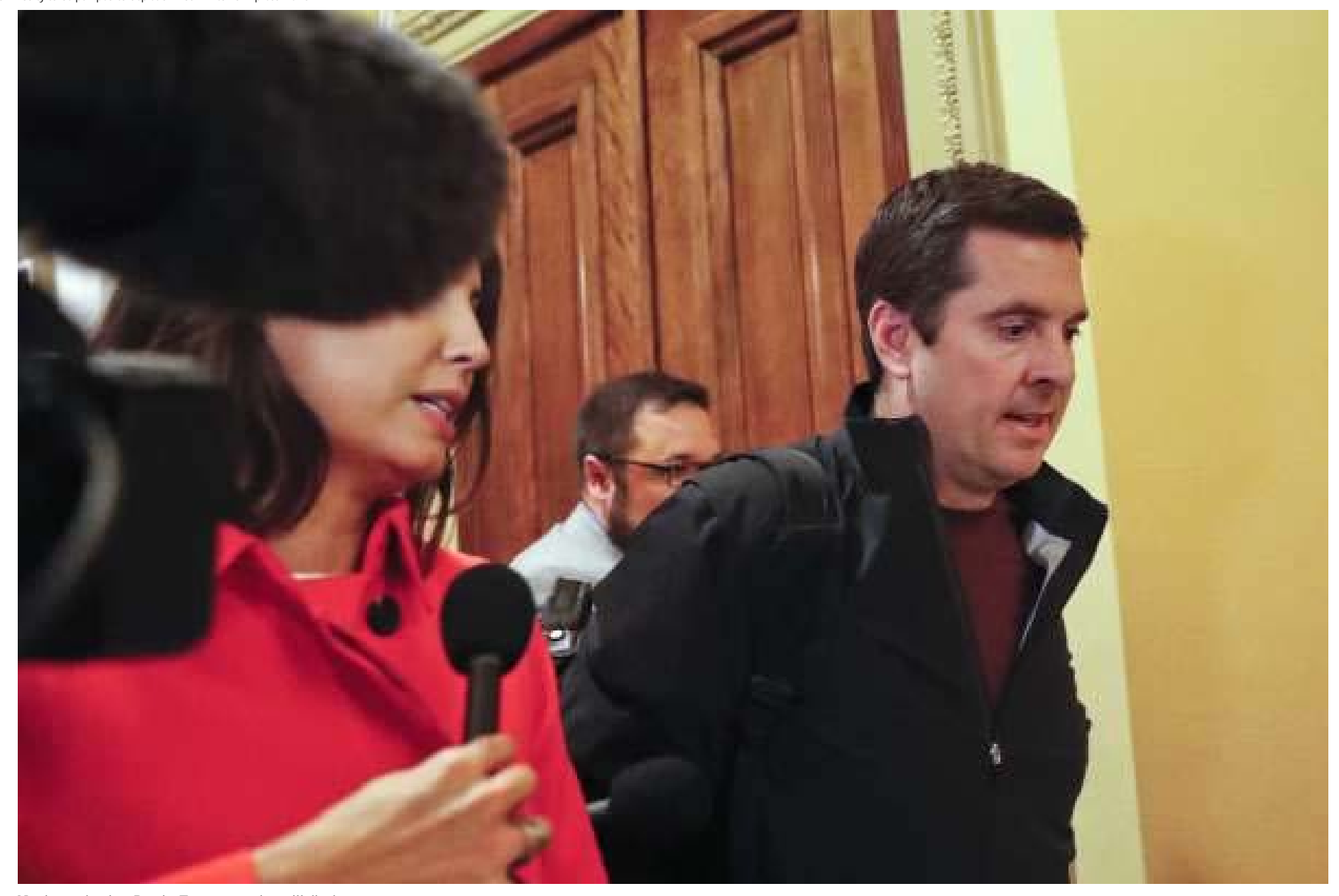
No sign probes into Russia, Trump campaign will die down