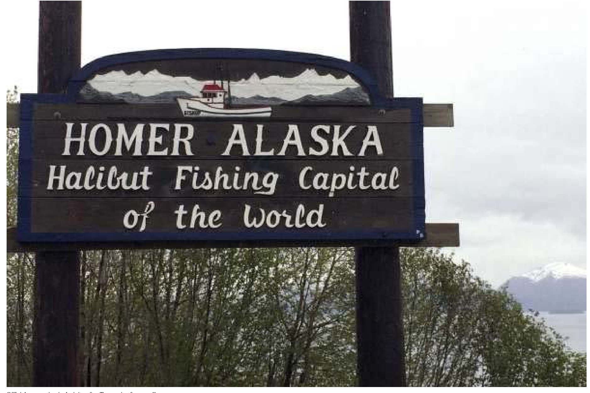
Officials promoting inclusivity after Trump rise face recall