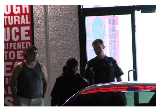
Masked robbers hit two S.A. pizza restaurants overnight on...