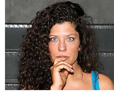
Type in Your Name, Wait 7 Seconds, Brace Yourself